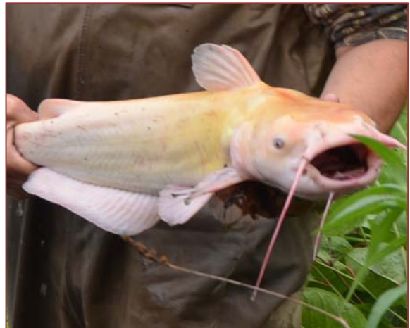
One of a number of ‘albino’ channel catfish stocked this week into the Community Fishing Areas. Approximately a third of the large (14-18 inch fish) catfish stocked were ‘albino’ fish.

The yearling catfish were stocked into Black Pond (Middlefield) -1,200 fish, Maltby Lake (Orange/West Haven) 2 -350 fish, Maltby Lake 3 -350 fish, Lower Bolton Lake (Bolton) -2,500 fish, Pattaconk Lake (Chester) -800 fish, Silver Lake (Meriden) - 2,200 fish and Lake Wintergreen (Hamden) – 750 fish, all stocked since 2007 and four new areas , Hopeville Pond (Griswold) – 2,100 fish, Quinebaug Lake (Wauregan Reservoir, Killingly) – 1,650 fish, Stillwater Pond (Torrington) – 1,650 fish, and Lake Kenosia (Danbury) – 1,450 fish. One lake stocked in previous years, Lake Quonnapaug (Guilford), is no longer being stocked as the fishery was not meeting program expectations.